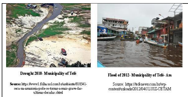
Figure 2: Extreme events in the municipality of Tefé-AM. The left the extreme drought event in 2010 and the right the severe flood event in 2012.