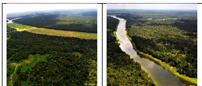
Figure 1: Mamirauá Lake (drought of 2010).

A 25-year series of lake level measurement (1992-2017) was used in this study. The technique of descriptive statistics of maximum, minimum and average quotas of the years of fluviometric monitoring was used, since it seeks to verify the lake level relationship with the occurrence of extreme events that happened over the years.